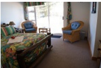
Double bed in room Shower in en suite