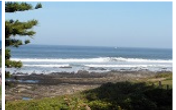
VIEW FROM SEA OTTERS LODGE