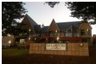
VIEW FROM THE BEACH