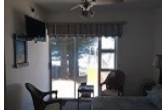
2 x Single beds in room Shower in en suite