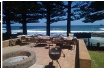
BOMA / BRAAI AREA