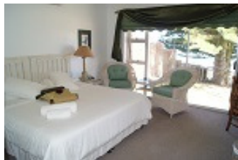
King Size bed in room Shower and bath in en suite