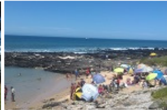
DIRECT ACCESS ONTO BEACH