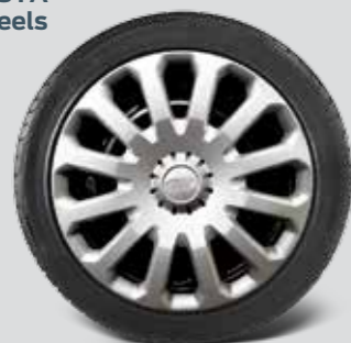
15" Steel wheel with styled cover Standard on Ambiente