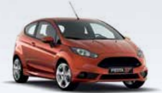
Molten Orange (Metallic*)