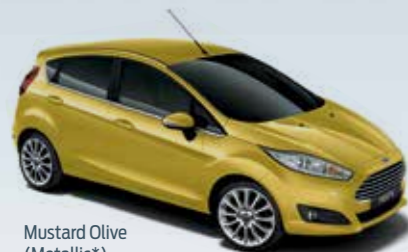
Mustard Olive (Metallic*)