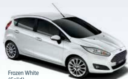
Frozen White (Solid)