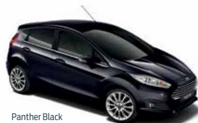
Panther Black (Metallic*)