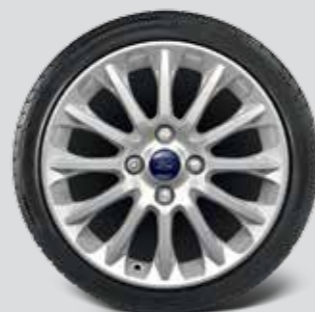
16" Alloy wheel Standard on Titanium