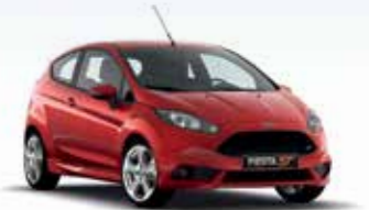
Race Red (Solid)