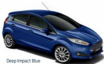
Deep Impact Blue (Metallic*)