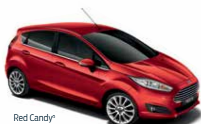
Red Candy* (Metallic*)