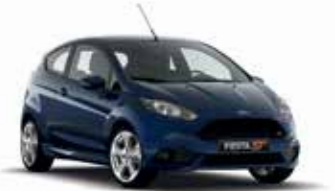
Spirit Blue (Metallic*)