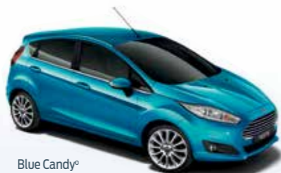
Blue Candy* (Metallic*)