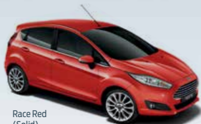
Race Red (Solid)