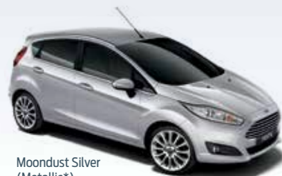
Moondust Silver (Metallic*)