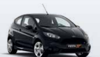
Shadow Black (Metallic*)

*Metallic body colours are options at extra costs.