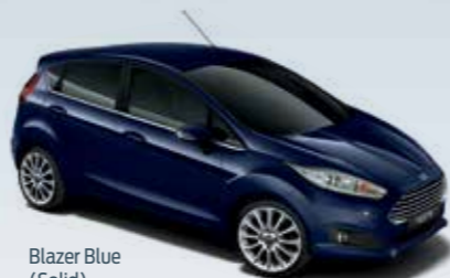
Blazer Blue (Solid)