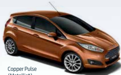
Copper Pulse (Metallic*)