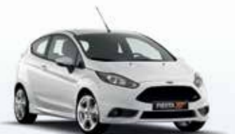
Frozen White (Solid)