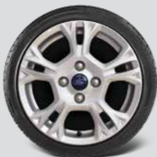
15" Alloy wheel Standard on Trend