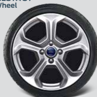
17" Alloy wheel 205/40/R17