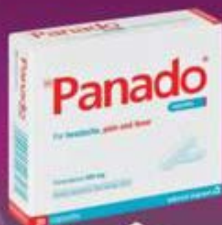
PANADO CAPSULES, 5/2.5/0007 752355-015, 100 mg, 20 Paracetamol 500 mg