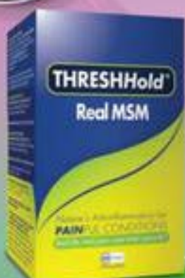
THRESHHold REAL MSM Tablets, 60's