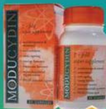
MODUCYDIN Capsules, 60s