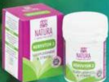
NATURA NERVUTON 2 Tablets, 150s

Full range not necessarily available through all retail outlets