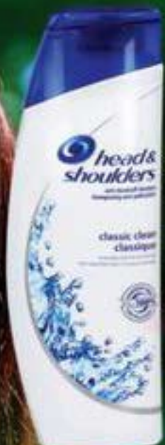
HEAD & SHOULDERS SHAMPOO Assorted Variants, 200 ml

*Some Over The Counter (OTC) items may require capturing of your details. Scheduled S, S, S, S and S, S products will require a valid prescription from your healthcare practitioner. Speak to your Pharmacist for more information.