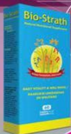
BIO-STRATH Tablets, 60's