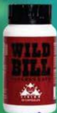
WILD BILL Potency Caps, 20s