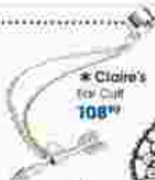
* Claire's Ear Cuff 108 00