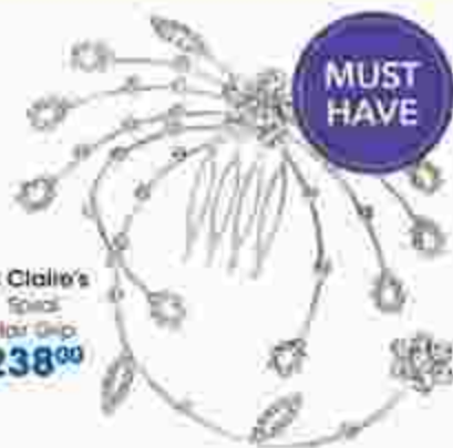
* Claire's Spinal Hair Grip 238 00