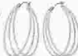
* Claire's Chain Necklaces 108 00