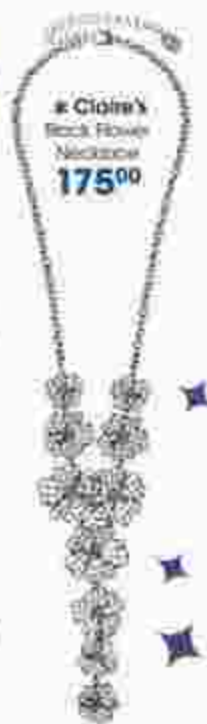
* Claire's Back Flower Necklace 175 00

Sparkle this party season with some glitzy and glamour!