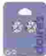
* Claire's Crystal Stud 230 00