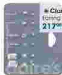
* Claire's Earring Pack 217 00