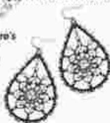
* Claire's Chandelier Earrings 175 00